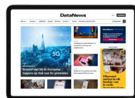
DataNews ONLINE ONLY